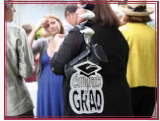
Congratulations 2009 graduates

"Thank you to everyone who has helped me along the way,"