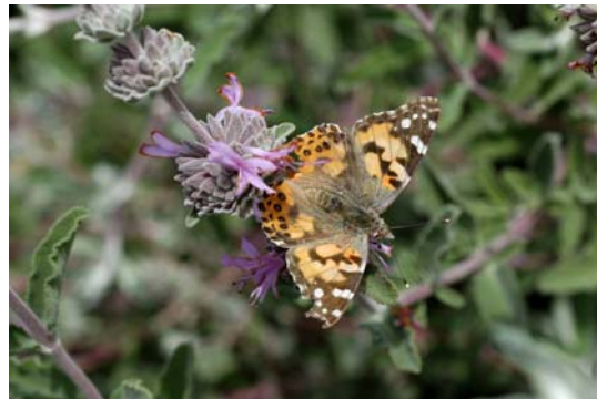
The painted lady butterfly is a frequent visitor to Ulistac’s Bird and Butterfly Garden, maintained by UNA-REP volunteers.

The mission of UNA-REP is to help restore and preserve native habitat at Ulistac Natural Area, while providing opportunities for outdoor recreation and education about California ecosystems and the Ohlone people.