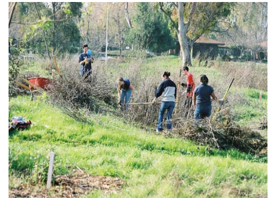
Volunteers clear weeds at a Ulistac workday.

Ulistac Natural Area was created by a grassroots effort of community members who wished to save Santa Clara's remaining open space from development. Formerly a golf course that fell into disuse, the 41-acre parcel was designated a city park in 1997.