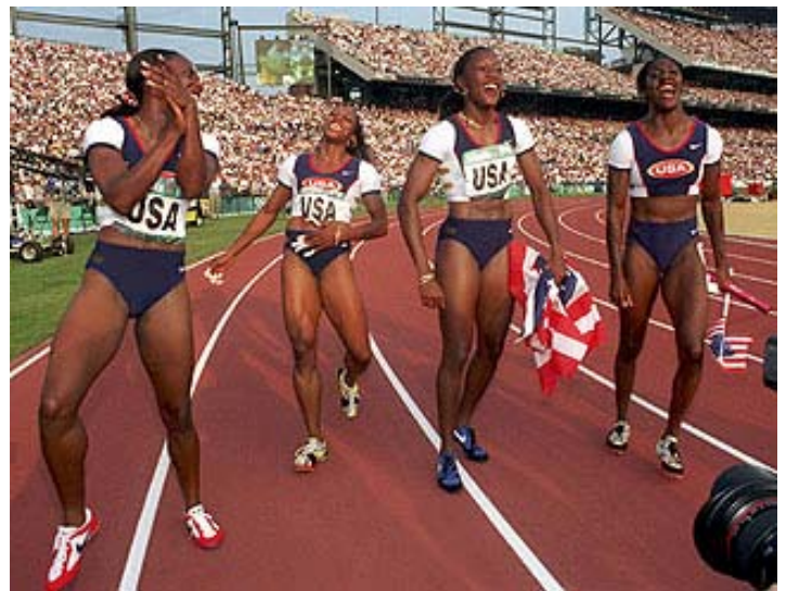
Victory Lap, Atlanta, GA