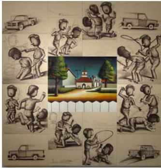
Welcome to Texas , a painting about the James Byrd tragedy