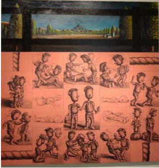
Pinky Goes to Town , a work about the Matthew Shepard tragedy