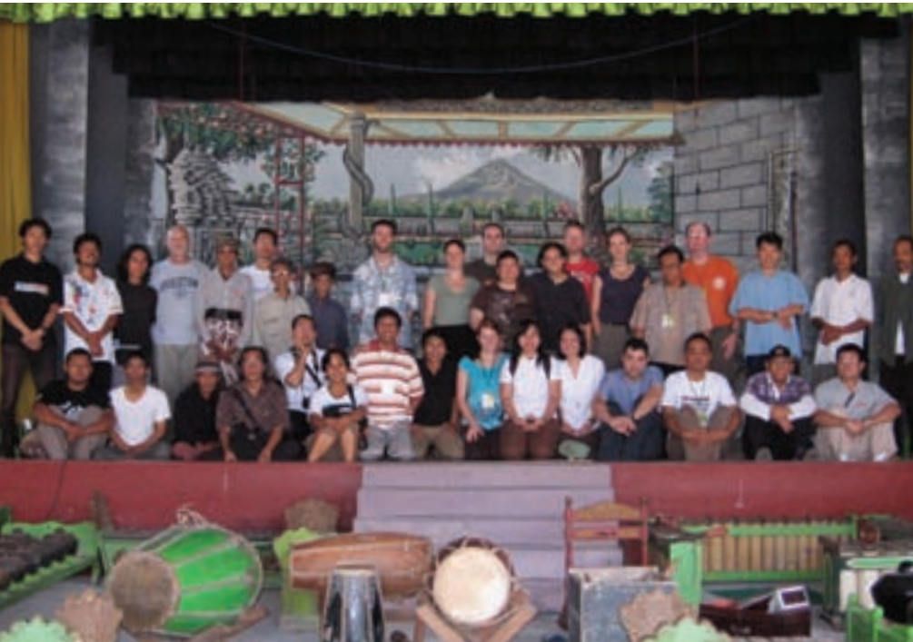
THIS PAGE: top to bottom: (1) Daily fresh palm offerings at the Besakih temple on Bali during the festival of Diwali (EB); (2) Volcano Mount Merapi viewed from the Buddhist monument Borobudur (EB); (3) Banners of dried rice and palms decorate virtually every street corner on Bali during Diwali (EB); (4) Jesuit School of Theology group with Indonesian companions and artists at a cultural center near the Catholic parish of Sumber; the instruments in front compose the gamelan, the traditional Javanese orchestra (MS).