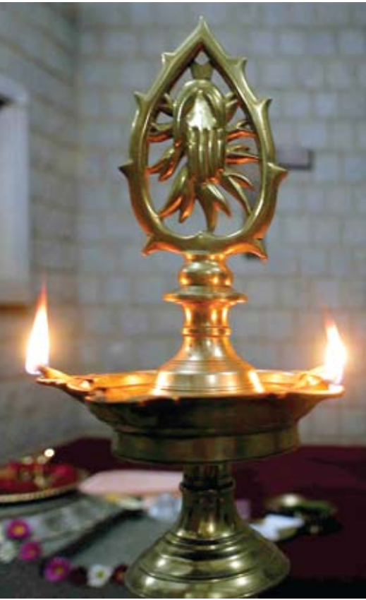
Oil lamp with representation of the hand of God at the National Liturgical Center in Bangalore, India.