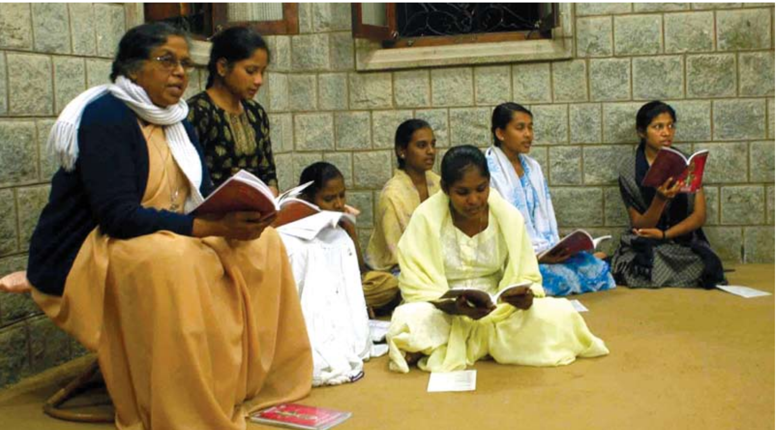
Women Bhajan chanting during Mass at the National Liturgical Centre in Bangalore, India.

I can easily report all of these facts, but how did the liturgy feel? In the smoke of