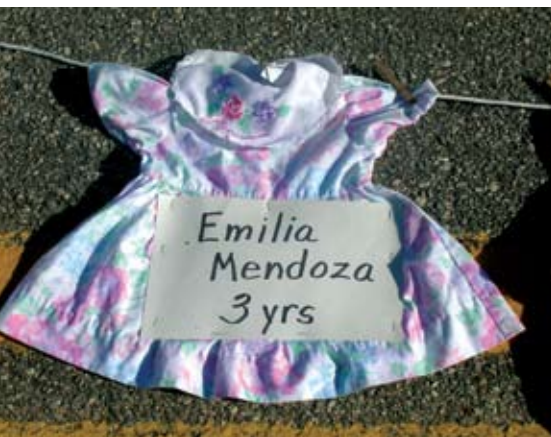
Clothesline Project honoring one of the many innocent victims of WHISC-sponsored violence.