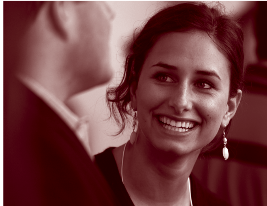
Caption: quis nostrud exerci tation ullamcorper suscipit lobortis nisl ut aliquip ex eaduki commodo consequat. Ibh eummodo loboreratue eu feugiam, consequate tem ilit ea fon feusmodit adiam alit, vel ut ilit iusciduis doloreet, conullam ipit nosto

Eps, adducon vocre, C. Damene cum verit Catiline rfcupri