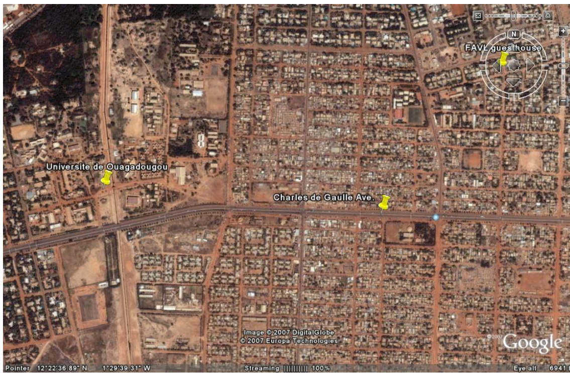
Google Earth image of Zogona neighborhood and FAVL office/guesthouse