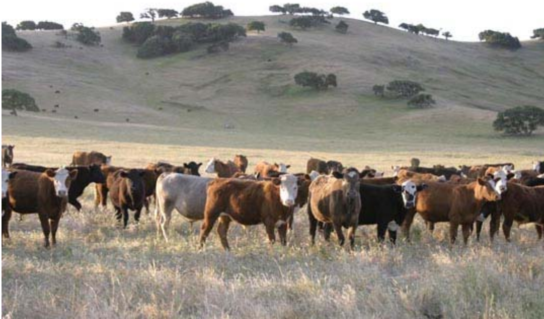
Grass-Fed Beef, Marin Sun Farms in Point Reyes Station