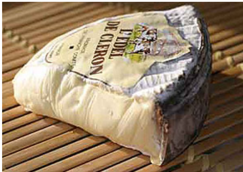
Raw Cheese, Cowgirl Creamery, Point Reyes Station