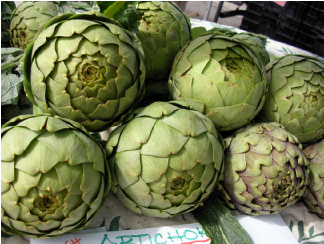
Artichokes, Mariquita Farm in Watsonville