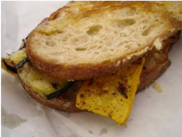
Brickm maiden Whole Wheat Bread, Berkeley Farmers' Market