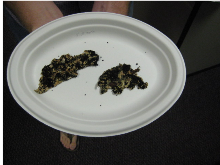
A Benson plate after 10 days of composting last spring