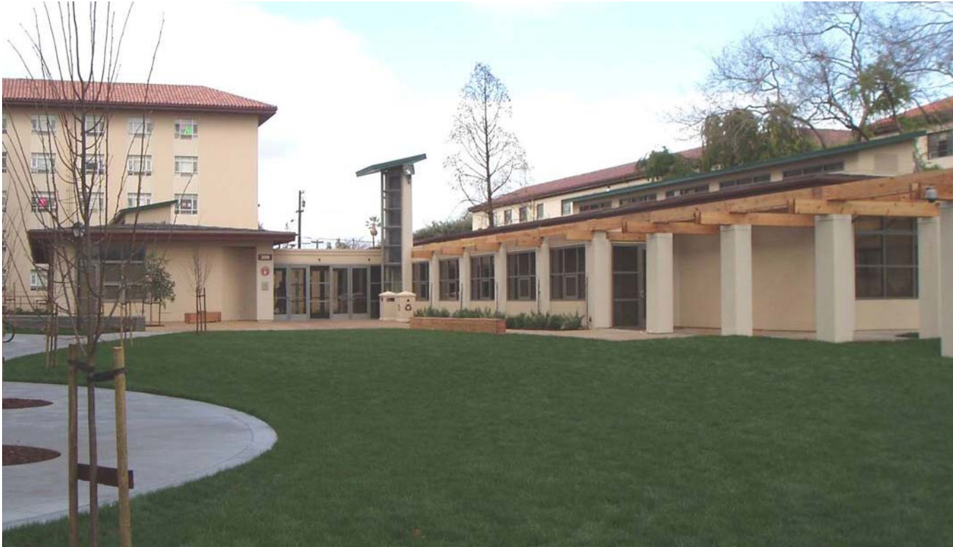
Kennedy Commons: Santa Clara's "green" building finished in 2006