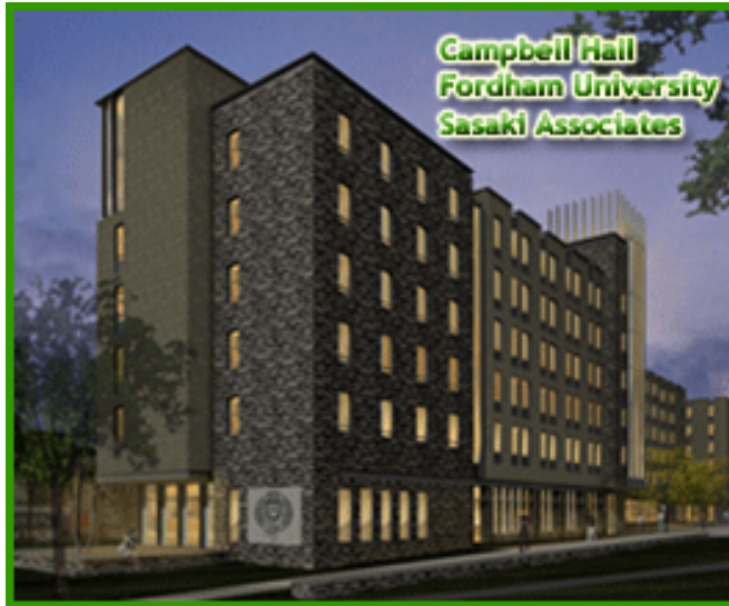
Campbell Hall, Fordham University's new "Green" dorm