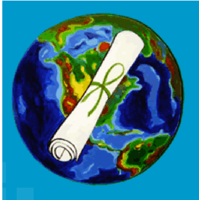
Graduation Pledge Alliance