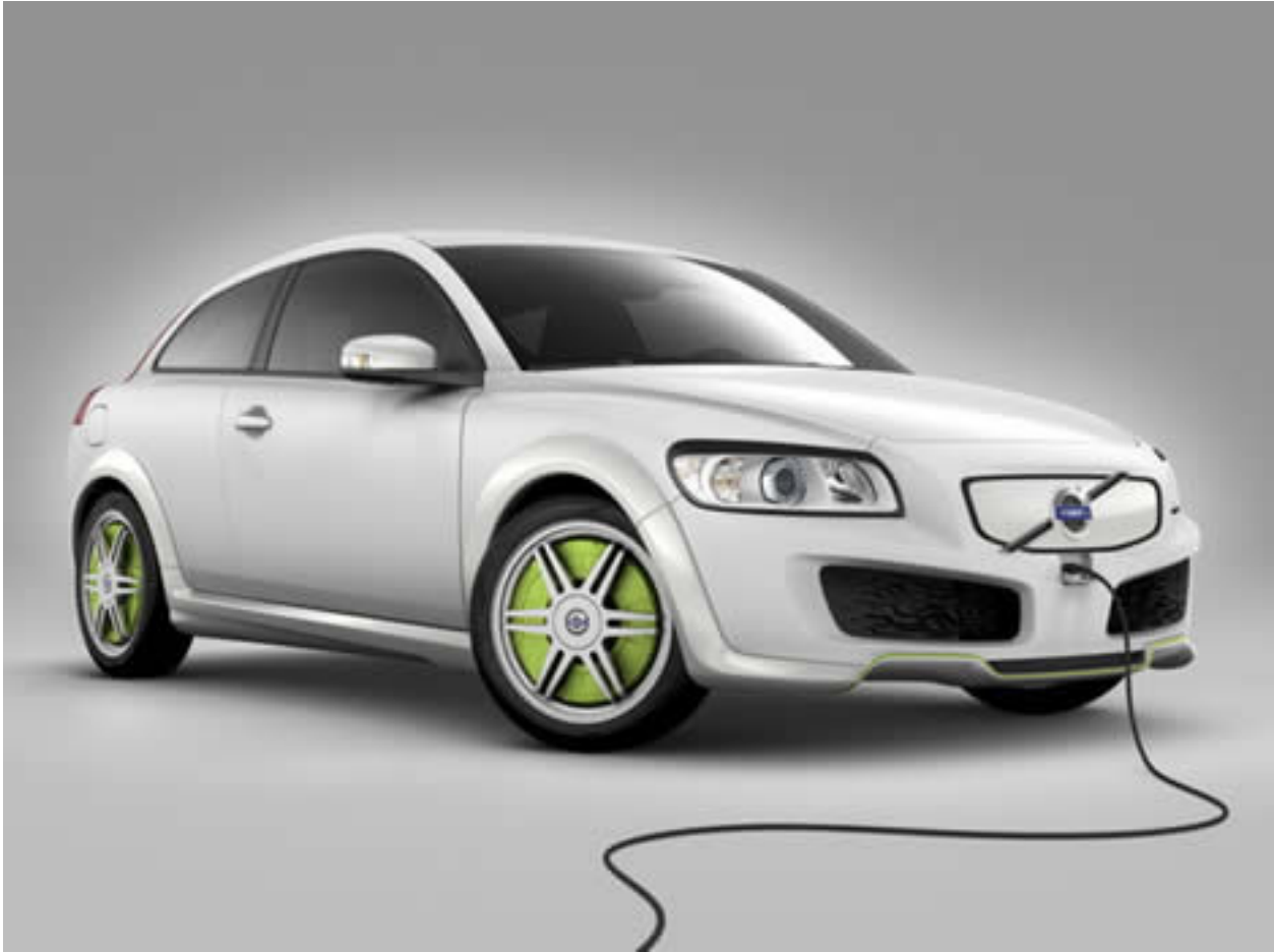
The Volvo ReCharge Plug-In Hybrid: an Example of an Alternative Fuel Car