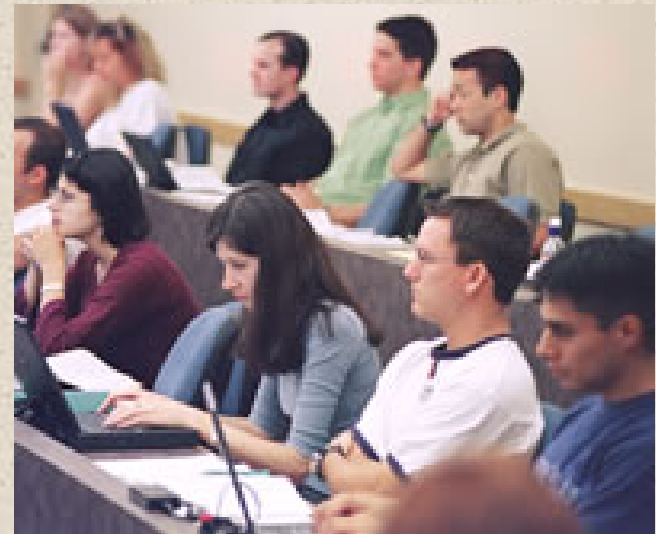
Law class at SCU