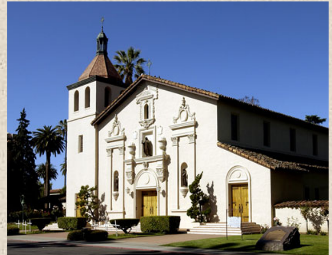
Santa Clara University Mission Church

Finally, we examined "best practices" of other law schools in the surrounding Bay Area and also of the top Environmental Law programs in the nation in order to offer suggestions for developing a more comprehensive Environmental Law department at SCU.