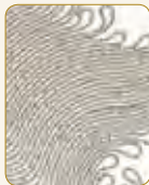
Shoonya (detail), Meg Hitchcock

DIALOGUING WITH SACRED TEXTS: AN EXHIBIT OF SACRED TEXTS PAST, PRESENT, AND FUTURE