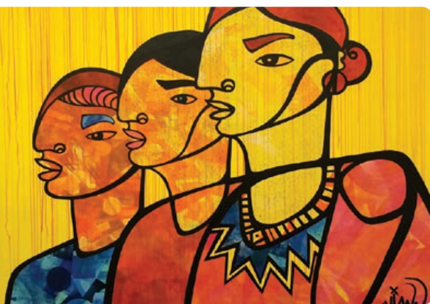
Favianna Rodriguez, "There Is A Light That Never Goes Out," Mural, Acrylic and house paint, 2014. Used with permission.

The INTEGRAL podcast will feature a six-part series on Gender Justice and the Common Good: October 3-November 7, 2017. Access all episodes at scu.edu/integral