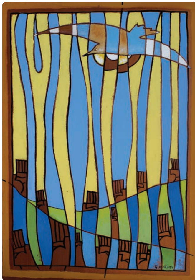
Herve Patrick Gigot, Republic of Benin, acrylic on canvas. Used with permission.

Previous publications available at scu.edu/explore