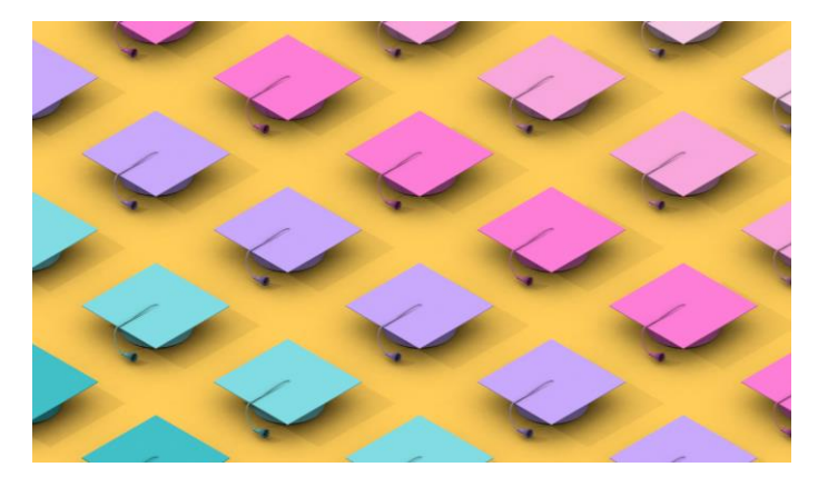
Multicolored graduation caps.