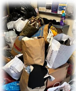
Donations for Buckys Closet collected at our luncheon

Thank you so much for your generous donations! We hosted our first clothing drive for Bucky's Closet at our November luncheon and boy was it a big hit! Your kind donations completely filled two cars, making many more boxes of clothing and school supplies available to our SCU students.