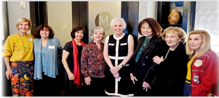
SCU Catalá Club Present & Past Presidents