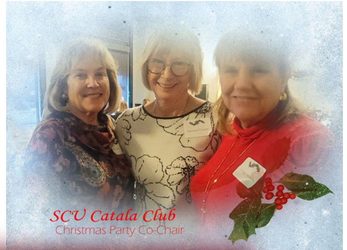
SCU Catalá Club Christmas Party Co-Chair